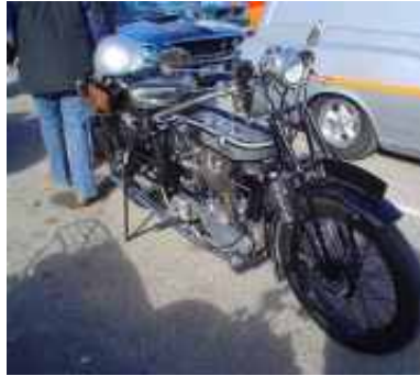
1913 Triumph and 1964 Ariel Golden Arrow Sports on Copper Coast Classic