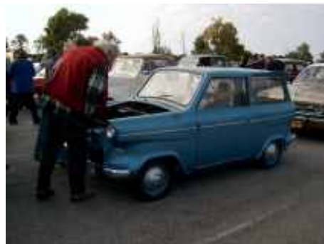
Who pinched the Donk? Maureen calling for help