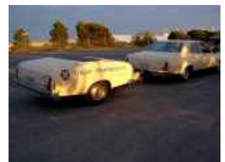
Take three P76's and cut and weld