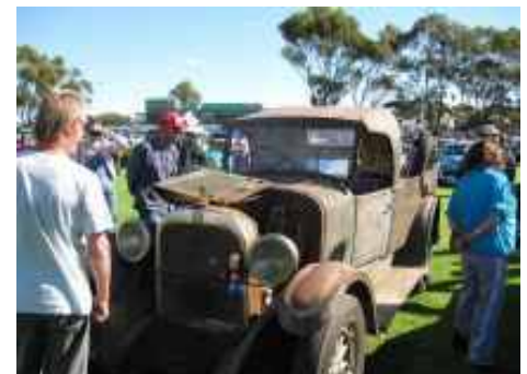
A Farm Find!