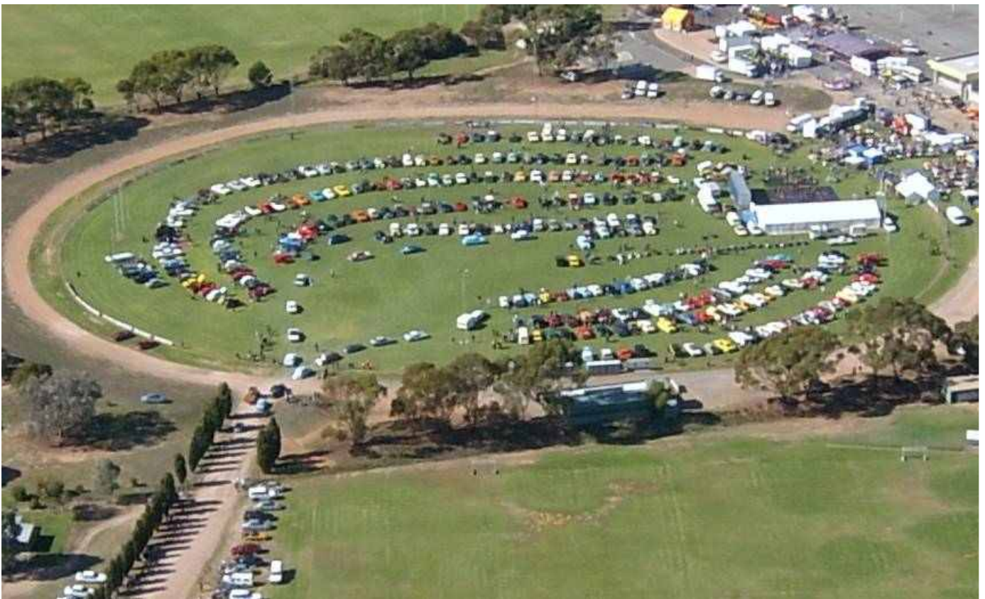
Aerial View of Kadina Oval at the Copper Coast Classic