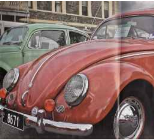
Colin Curtis's VW Beetle as featured in the centre spread of the Hungarian VW Enthusiast Magazine "VWDEPO" (see story Page 14)