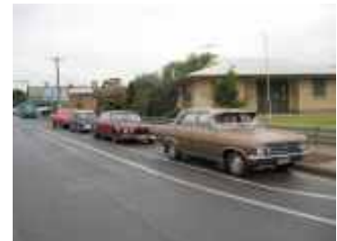
Members cars on the May Sparrow Run to Mallala