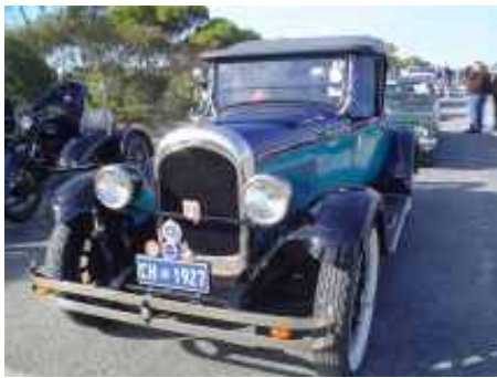
No 1 again??? The Unsworth Chrysler