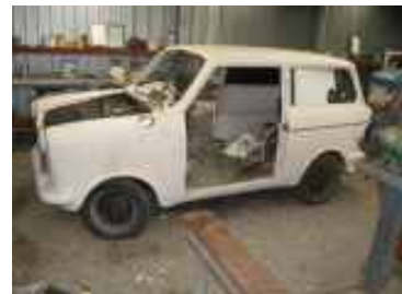
Restoration stalled? National Trust Museum Kingscote KI