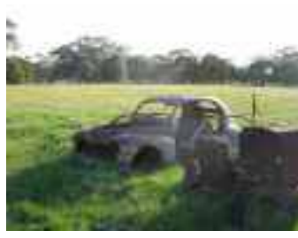
Peugeot 203 and 1924 International at Duck Ponds KI