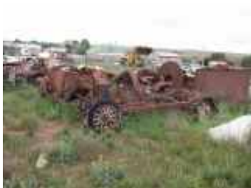
Behind old garage at Penong on Eyre Peninsula

A collection from the Editor's wanderings this year