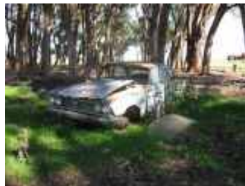
It's all there! Prince Gloria at Talia EP