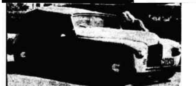
TWO VIEWS of an Australian car built in Adelaide by Wiles Manufacturing Co., Mile End. It is a five-seater, two cylinder, 1.2 horse-power car with front-wheel drive and four-wheel hydraulic brakes. The car has four gears, three forward and one reverse, with the gear lever on the dashboard.