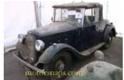
Finished it will look something like this

Datsun 1200 ute Automatic Leather seats New tyres Tonneau cover Rare long tray Model Very Good cond overall Price $7500. Bruce 8252 5971 (1110)