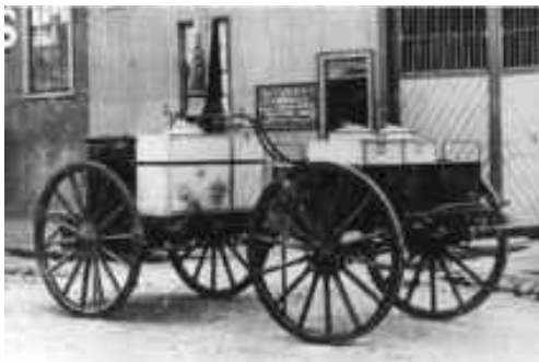
WW1 Wiles Cooker

(Editors Note: such snippets send me sleuthing through the internet, but I had only limited success. There is no mention of the Wiles Car. The Wiles Manufacturing Company of Mile End manufactured farm plant in the 1950's and railway rolling stock in the 1960's and may have been the same company who manufactured the Wiles mobile cooker used by military forces in WW1 and WW2 and beyond, the last being phased out in 1980. A number of examples are housed in the Military Vehicle Museum at Port Adelaide and it is known that the concept of the Cooker was developed in Adelaide. The cooker was operated by steam, raised by burning oil, to cook food and heat a baking oven.)