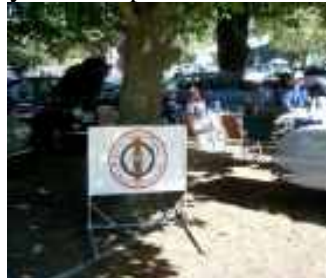
GVVCVC on Display