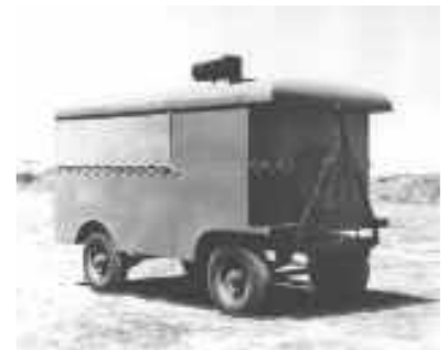
WW2 Wiles Senior