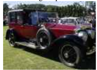
L-R: Halfords XJ6, a SS, a Napier, a Rolls