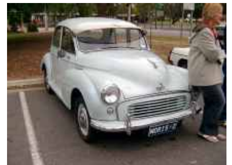
On the Gliding Run to Whitwarta