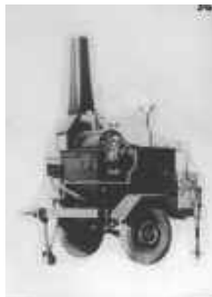
WW2 Wiles Junior