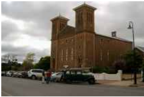
Motorfest at Kapunda Museum