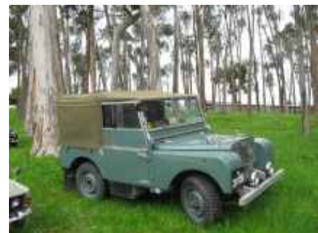
Very rare A 1948 (first year of manufacture) Land Rover Northern Auto Restorers Club, Kapunda Chapter