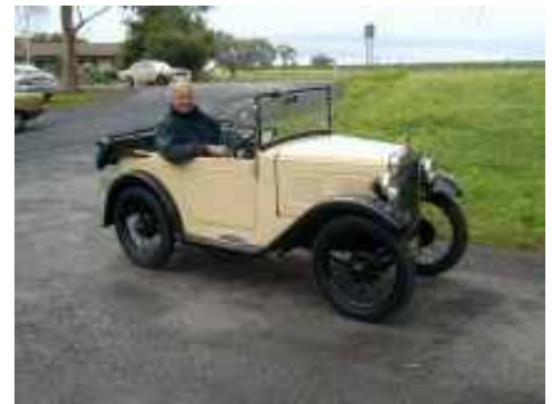
1930 Austin Chummy