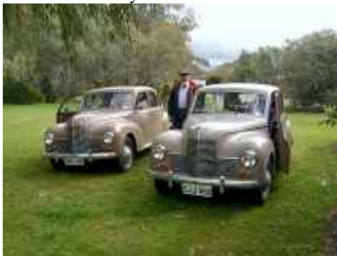
2 1950 Jowett Javelin PC's