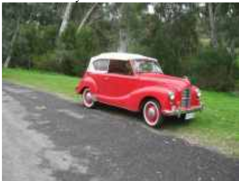
Austin A30 Barossa Valley Club