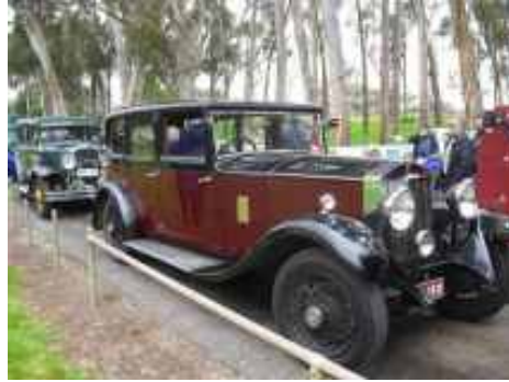
1930 Rolls Royce CMV Historical Society