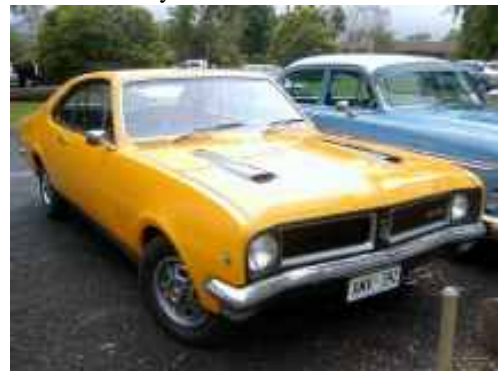
Very Nice Monaro