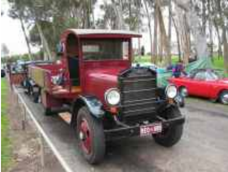
1930 REO truck CMV Historical Society